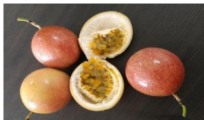
Figure 1. Red Passion Fruit ( Passiflora edulis Sims).

Red passion fruit ( P. edulis Sims.), known as sour passion fruit, is one of the species of passion fruit and belongs to the family of Passifloraceae . This species is unique and has two different performances namely purple skin (growing in subtropical and tropical highlands) and red skin (growing in lowland tropics) (Karsinah and Mansur, 2010). In this study, the red passion fruits (Fig. 1) from a local farm in Sidoarjo (East Java) were used.