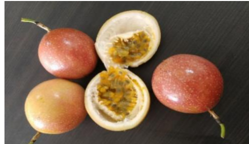
Figure 1. Red Passion Fruit ( Passiflora edulis Sims).

Red passion fruit ( P. edulis Sims.), known as sour passion fruit, is one of the species of passion fruit and belongs to the family of Passifloraceae . This species is unique and has two different performances namely purple skin (growing in subtropical and tropical highlands) and red skin (growing in lowland tropics) (Karsinah and Mansur, 2010). In this study, the red passion fruits (Fig. 1) from a local farm in Sidoarjo (East Java) were used.