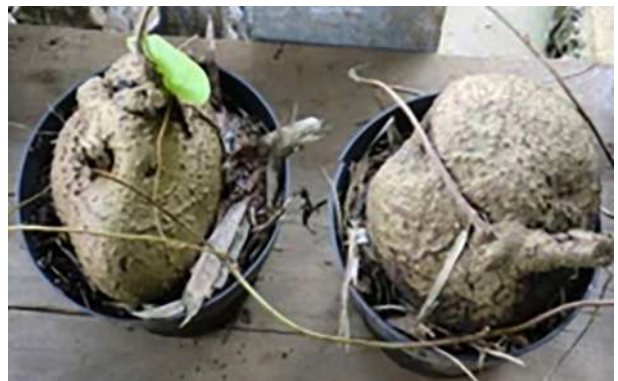
Figure 1. Indoensian Bidara Upas ( Merremia mammosa L.).

Bidara Upas is a woody vine with a stem length of 3-6 m. The stem is a bit slippery, small, and purplish red. Bulbs are in the ground, elongated round shape. The tuber skin is brownish-yellow, thick, and gummy. The tuber flesh is white (21).