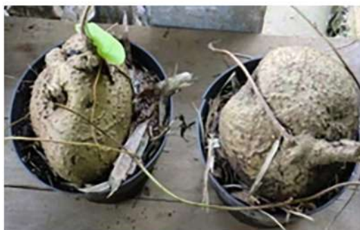
Figure 1. Indoensian Bidara Upas ( Merremiamamosa L.).

Bidara Upas is a woody vine with a stem length of 3-6 m. The stem is a bit slippery, small, and purplish red. Bulbs are in the ground, elongated round shape. The tuber skin is brownish-yellow, thick, and gummy. The tuber flesh is white (21).